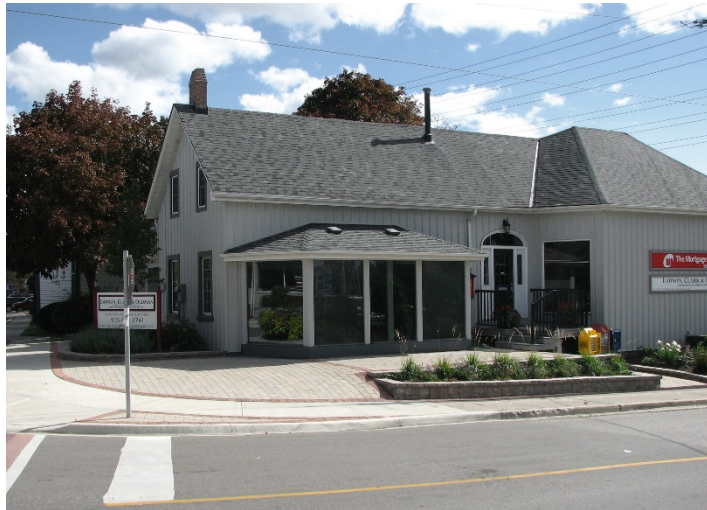
View from the west.