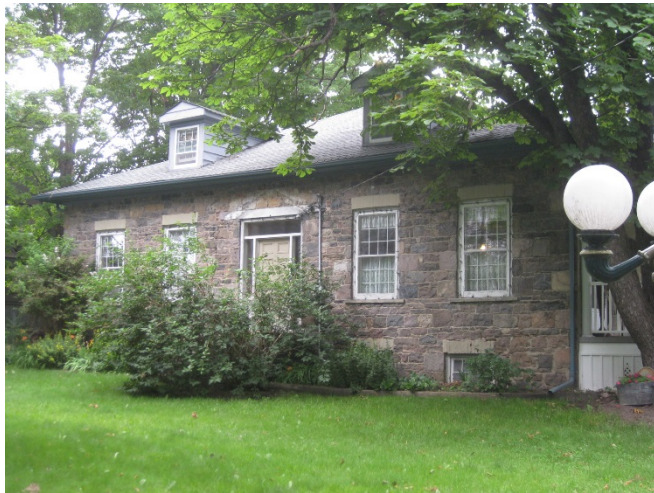
South façade, originally the front. Wonderful stonework.

Description: Original property was extensive, with main entry (now facing the south side yard) fronting Old Kingston Road. That façade is a simple 5-bay design. Entry with sidelights is a replacement, and there is evidence of previous portico. Dressed limestone lintels and sills. Wide basement windows below main floor windows, and gabled dormers above inner ground floor windows. A broad porch faces Linton Avenue, and the wall has been rendered to appear as ashlar masonry. This is the kind of “upgrade” that was often applied to make an old house fit a new fashion. Substantial front and side yards with mature trees provide a fine setting for a fine house.