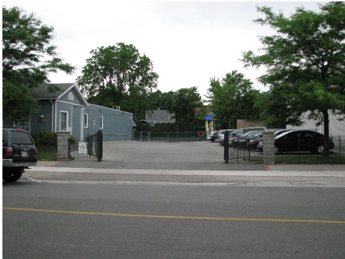
Parking lot to the east of the school. The simple box mass of the original.

History: This was the local IGA supermarket until large-scale chain stores in surrounding malls rendered it uncompetitive. The bulk of the supermarket building remains. The Montessori School occupied the building in 1997, and constructed the domesticated front façade, which goes some way to fitting in to the Village character. The trees and landscaping provide an additional softening effect.