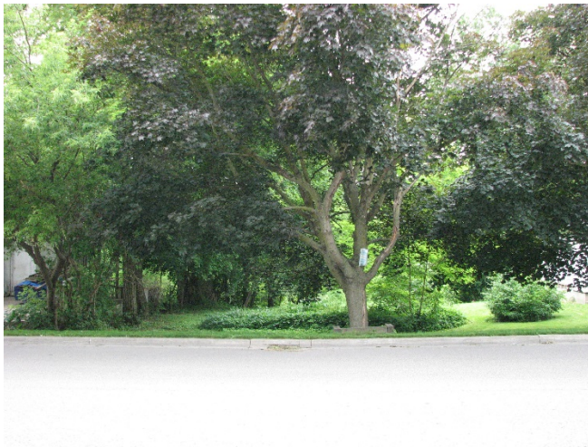
Large side yard to the south of the house.

Description: Archetypal 3-bay vernacular Victorian house, with steep central gable. Siding, windows, and entry door are all modern replacements, but the casings, including the pointed-arch gable window, appear to be original. There is a small shed-roof addition towards the rear of the south wall. The lot is very large—the south side yard is wide and well-planted. The house appears to be in sound condition, without evidence of leaning or sagging. This could be a fine restoration project for a sympathetic owner.