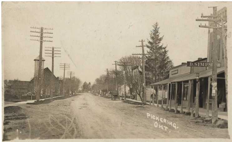
The bell tower is behind the Hydro pole on the left. The Dunbar Store is on the right. The Town Hall building was torn down in 1956.