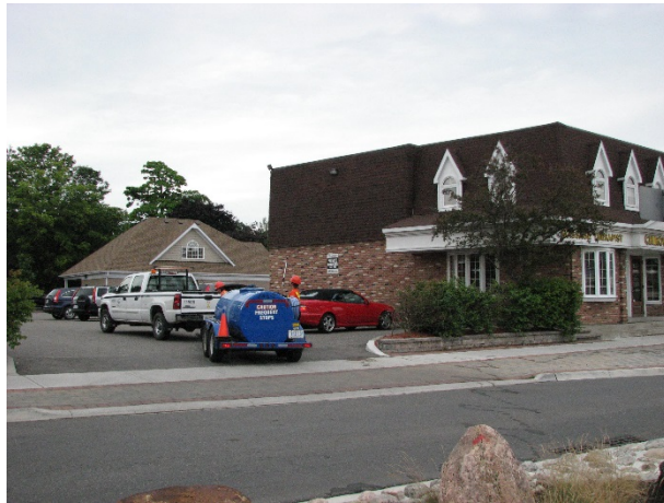
Oblique view showing west wall and adjacent parking lot. The building behind is part of the McEachnie Funeral Home, and is described under 20 Church Street North.

A historical 'mash-up' but well-mannered in terms of scale and detailing.