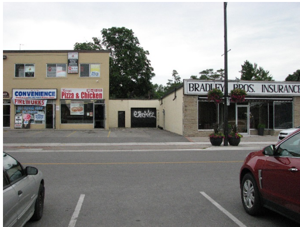
Recessed garage to the west

Description: A very nice modernist commercial building in almost original condition. Eastern shop includes a recessed storefront with a stone planter in front. Western shop has symmetrical façade with recessed central bay of two wide shop windows flanking a single entry door. This shop has an awning spanning the full glazing width. Back-lit sign boxes fill the entire spandrel area. An upright pylon sign on the roof of the eastern store un-necessarily detracts from the horizontal form of this classic modernist building.