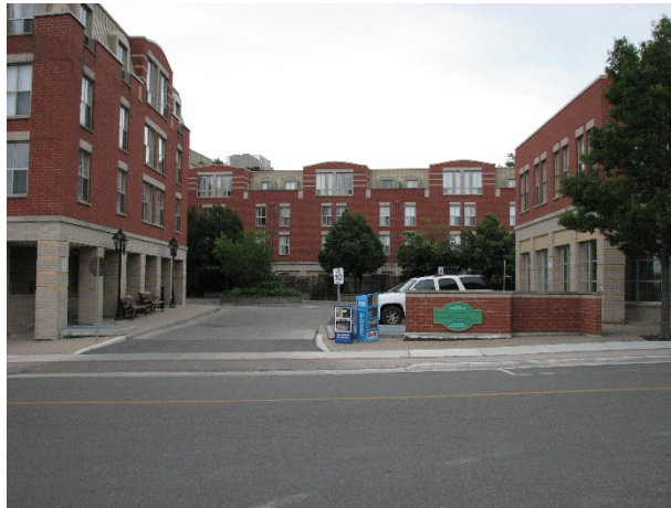
Parking lot to the west.

Description: Simple 6-bay composition with lower bays defined by brick pilasters, and 2 closely-set windows above in each bay. Upper storey is red brick with buff lintels. Lower storey is grey brick with buff accents, topped with a cultured stone band. 4-bay west façade of the same composition, facing adjacent parking lot. A well-mannered building, sympathetic to the area in material and scale.