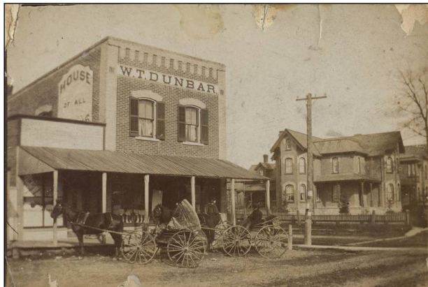
Historic image from Ajax Archives.