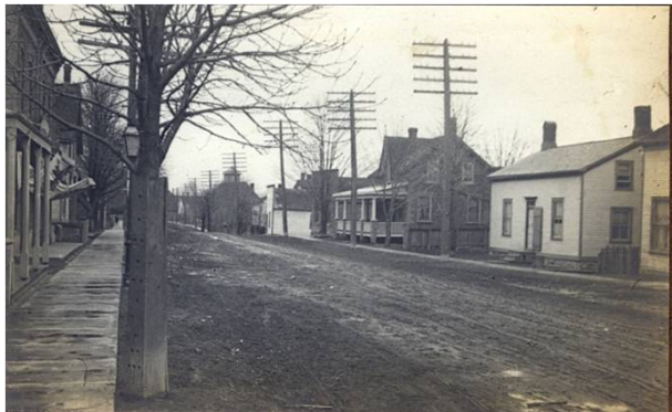
Historic image from Ajax Archives, Murkar house in the centre, News building beyond it.

Description: Vernacular Victorian 3-bay house with steep centre gable, with finial, housing a semi-circular arch window. Lower openings are segmentally arched, and the single door has a transom. Voussoirs and quoins are buff brick, contrasting with the red brick field. Wide porch on front and east side sits on round wood columns atop cast stone piers. The porch is believed to date from the 1920s. Large rear addition pays homage to Victorian style in polychromy gable dormers, and segmentally arched windows, without being authentic in detail or proportion.