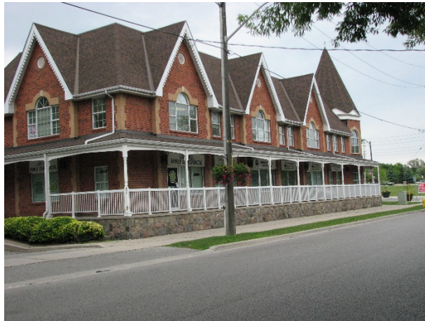
View from northwest.

Description: Victorian-inspired vernacular commercial building. Old Kingston Road façade has projecting front-gable bays at east end and centre, and an octagonal tower with a complex conical roof. Building is set back behind a broad lawn, with young trees and shrubs, on Old Kingston Road. The design continues for three projecting bays along Elizabeth Street. Continuous verandah with slender posts at each bay. Lower grade on Elizabeth Street frontage means verandah is elevated on a precast retaining wall with a white picket railing. Detailing is post-modern mixture of historic elements, including quoins, keystones, and palladian windows.