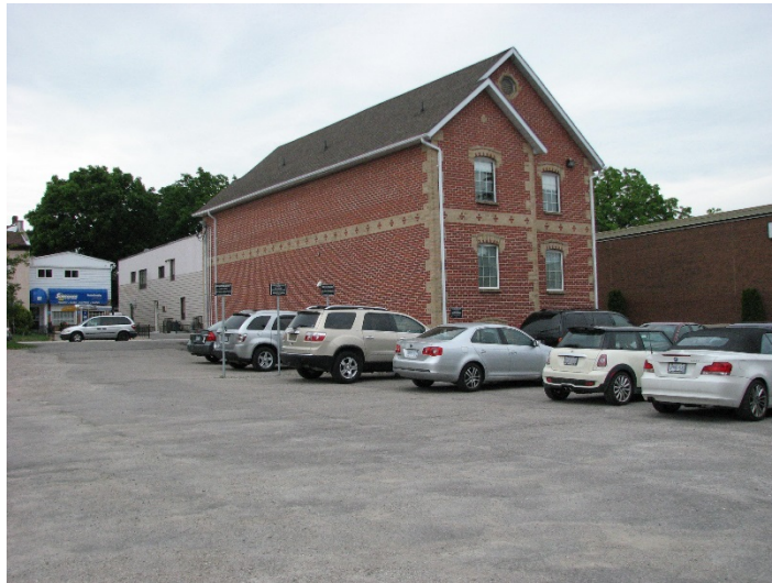
View from the southwest (rear).

Description: Front gable building with small bay to the west slightly projecting. Shallow shed-roof porch on the east. Top of gable has a small oriel near the peak. Building mass is red brick, with oriel, segmental arch window heads, quoins and a 5-course band at the second floor level of buff brick. The arches and the banding include red brick accents. East elevation has a similar side gable with oriel near the front. West wall is windowless, gableless, and featureless, except for the second floor band—it presents a fairly bluff appearance across the wide parking lot when viewed from the west.