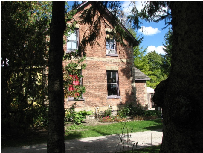
South façade, looking between the conifers. One storey kitchen tail at the rear is visible here.

There is a large side yard to the south, behind a row of mature conifers.