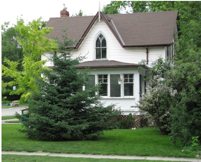
View from the west.

Description: Vernacular 3-bay Victorian Gothic house with steep central gable. The gable window is original, with gothic tracery in a pointed arch, and there is an original finial at the peak. There is an enclosed front porch across most of the front, of a later date. The 'kitchen tail' appears to be more recent, but there would have probably been such a wing in the original design. Front yard is fairly deep with many coniferous trees and shrubs. This is a corner lot, and the driveway is entered from the side street. A fine heritage property in good condition.