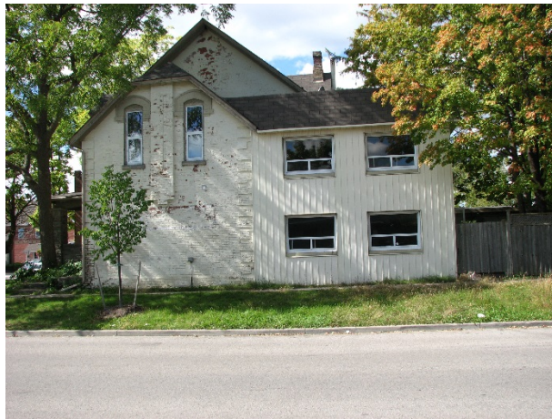
Linton Avenue elevation, showing modern frame addition at the rear.

Description: Vernacular Victorian gothic L-plan house. Projecting quoins. The recessed east wing addition is 1-1/2 storeys, with a single raised dormer window on the upper front façade. Most of the openings have shallow pointed arches with ornate hood details. The stone front porch and the rear frame addition are later additions, and stylistically different. Deep front yard compared to other properties on Old Kingston Road, with a wealth of large mature trees. This significant building is showing signs of neglect. It deserves consideration for Designation under Part IV of the OHA.