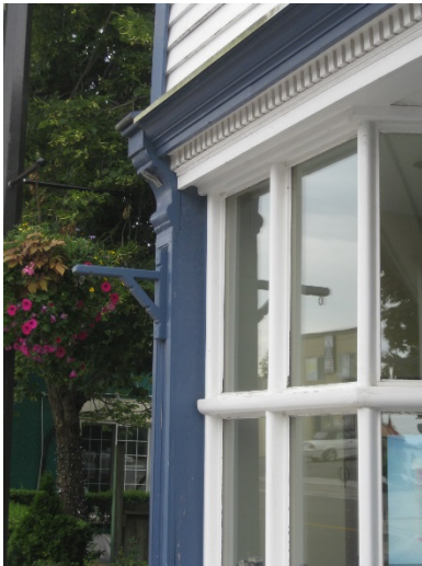
Detail showing pilaster, bracket, cornice, mullions, and clapboard spandrel.

Description: A simple vernacular shop, with large-pane mullioned wooden shopfront with a angled, recessed entry. There are two doors separated by a substantial post, suggesting that there once may have been two businesses here. The shopfront is framed with pilasters and a cornice is anchored by substantial brackets which are duplicated at the top corners of the building. The substantial spandrel above carries a modern backlit sign. The west side was formerly a residence—a common Ontario village arrangement. The residence is described on the next page.