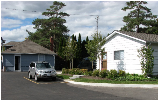
Rear outbuildings. The one on the right is recent. The one on the left may have been a stable/garage for the old dairy.

History: This was the site of the Pickering Dairy and the associated dwelling, which was moved to 19 Elizabeth Street in 1949.