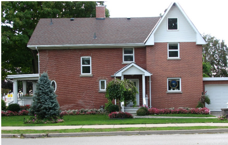
Sherwood Road elevation.