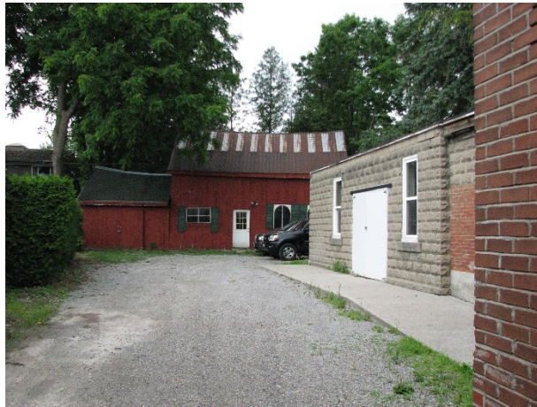
View north toward the barn, showing the concrete block rear addition to the Monney Bakery building.

Description: Simple vernacular barn with smaller shed to the west. In horsedrawn days, it was not unusual for a business to have such a building nearby to house their delivery wagon and horses. This may have been such a building.