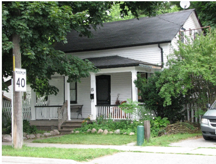
View from the southwest.