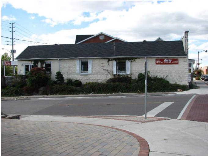
East elevation along Linton Avenue. The later rear extension is visible here.

Description: Simple gable roof commercial/industrial building with a flat-topped false-front parapet. Kingston Road façade is symmetrical, with recessed central door flanked by two large windows. The moulded concrete block is laid in a fairly elaborate pattern with large quoins. The main entry and the western side door feature lintels with "THE NEWS" integrally cast in large block letters. Entry is 5 steps up from the sidewalk. There is a later block addition at the rear. Raised planted area along Linton Avenue frontage on the east.