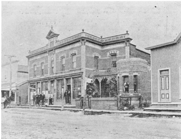
1905 photograph. Note that this photo pre-dates the construction of the bakery next door.