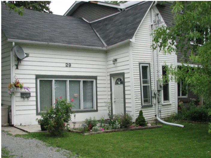
View from No. 29 from the northwest

Landscaped lawn with trees and shrubs, driveway to the north and south